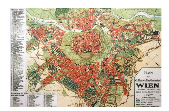
Fig. 1. Plan of Vienna in 1850

third biggest city in Europe after London and Paris. At the same time, P. Hall remarks that the quality of life in it was as in the traditional European city: overpopulated, unhealthy, communal, loud, full of life (Hall 1998: 177). It was a street-oriented city: walking outdoors was significant in all classes of society. In Vienna, as in a traditional city, people lived on the streets and used houses whereas people in most modern cultures use the streets and live in houses (Hall 1998: 177), which testifies the importance of the public space at that time. Although the author notes that today city dweller's life takes place at home, it seems that this tendency is changing nowadays.