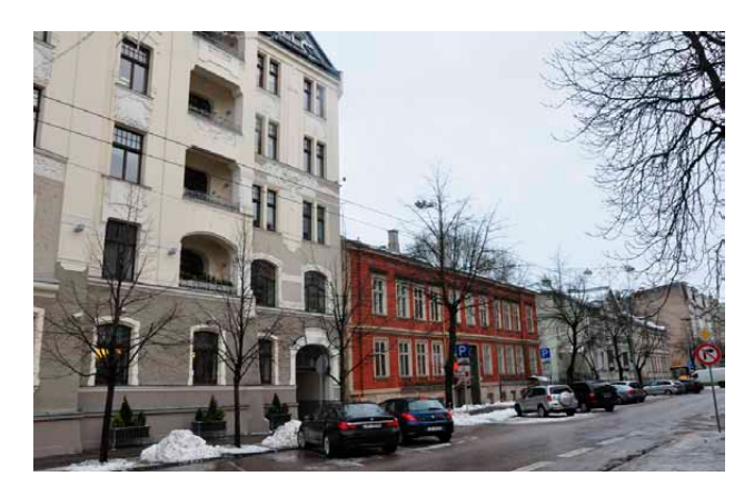
Fig. 4. Typical contrast in the HCR: two adjacent properties with absolutely different land use potential due to on land located current constructions. Wooden building must remain in its current physical parameters, which makes wooden heritage buildings not interesting for property markets and developers

Today large numbers of privately owned historical buildings (e.g. multi storey Art Nuveau buildings) are refurbished, well maintained and occupied (e.g. rented out for wide range tenants: local and international business, foreigners, etc.). However RE investors do not prefer to invest in wooden (low-storey) heritage buildings: they are difficult to maintain, expensive to remodel and have no option of demolishing the building or changing its physical size (Fig. 4).