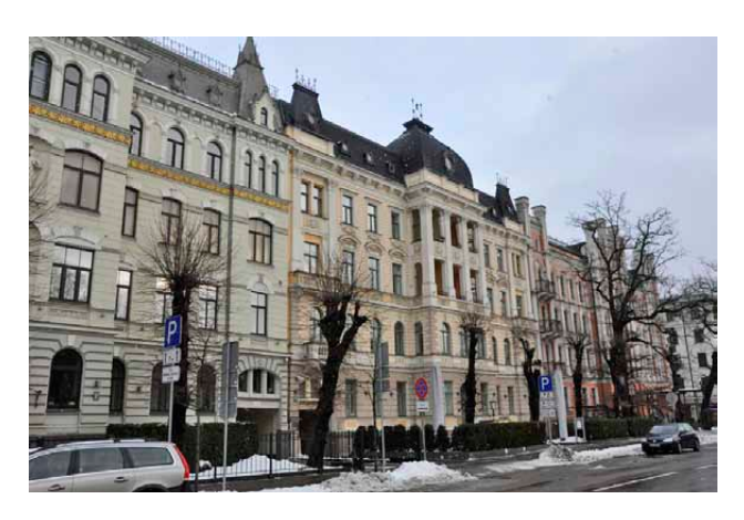
Fig. 3. A typical mixed use area in the HCR (Elizabetes Street) with well-maintained, fully occupied multi-storey buildings built at the beginning of 20<sup>th</sup> century

Latvia allows shared ownership: buildings and the land underneath can be owned by different owners. It makes property market and construction activities more complicated and increases the administrative burden (see Cabinet of Ministers 2012; Latvijas Zinātņu akadēmijas Ekonomikas institūts 2011).