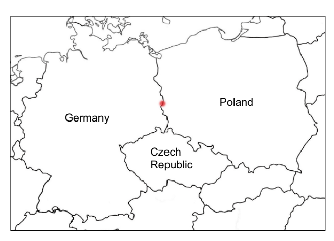
Fig. 1. The location of Gubin and Guben

However, at the very beginning of the paper, the definition of the term urban waterfront must be specified. According to Januchta-Szostak (2011): "(...) the term 'urban waterfront' concerns the area where the city meets the surface waters, including both the natural and anthropogenic environment; though its landscape aspect is mostly perceived, it is still predetermined by social, ecological and economic factors. City waterfront consists of diverse forms of wharves, greenery strips, riverside infrastructure and development along the shore, usually visible against the city's