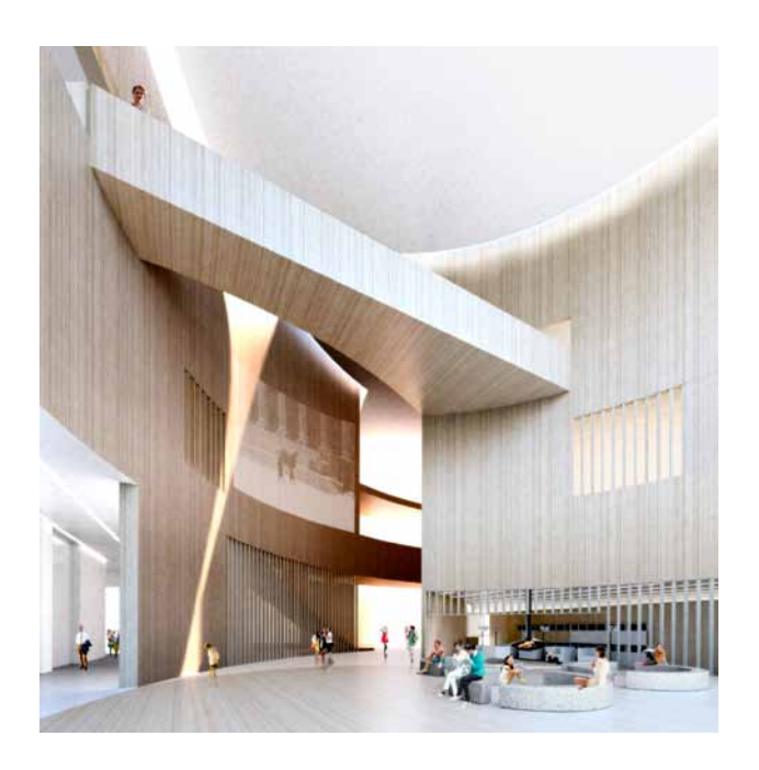
Fig. 3. Lahdelma & Mahlamäki , Made Arhitekti proposal from Latvian Museum of Contemporary Art competition

Caruso St John Architects (Switzerland) worked in partnership with Jaunromans un Abele, but have no timber construction projects. Latvian architects Jaunromans un Abele have several small sized wood architecture ventures. They understand material and work with timber for residential and public architecture. wHY Architect from the USA have some wood experiments, for example, the Waterfall pavilion, finished last year. Their Latvian partners OUTOFBOX Architecture & ALPS are working with different materials but don't have timber construction projects. Similar is the situation with other three teams—Sauerbruch Hutton (Germany) with Latvian architect Ingurds Lazdins, Neutelings Riedijk. Architects (Netherland) and Brigita Bula and Henning Larsen Architects (Denmark) with MARK Arhitekti.