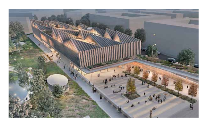
Fig. 2. Adjaye Associates and AB3D proposal from Latvian Museum of Contemporary Art competition

There wasn't a separate evaluation of the construction materials used but this was included in the sustainability section which was evaluated. These projects demonstrated and described different aspects of sustainability, but even after all the public activities only one offer was made for a timber construction project. Adjaye Associates was selected